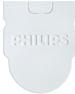
SmartBright LED batten G2 BN012C side